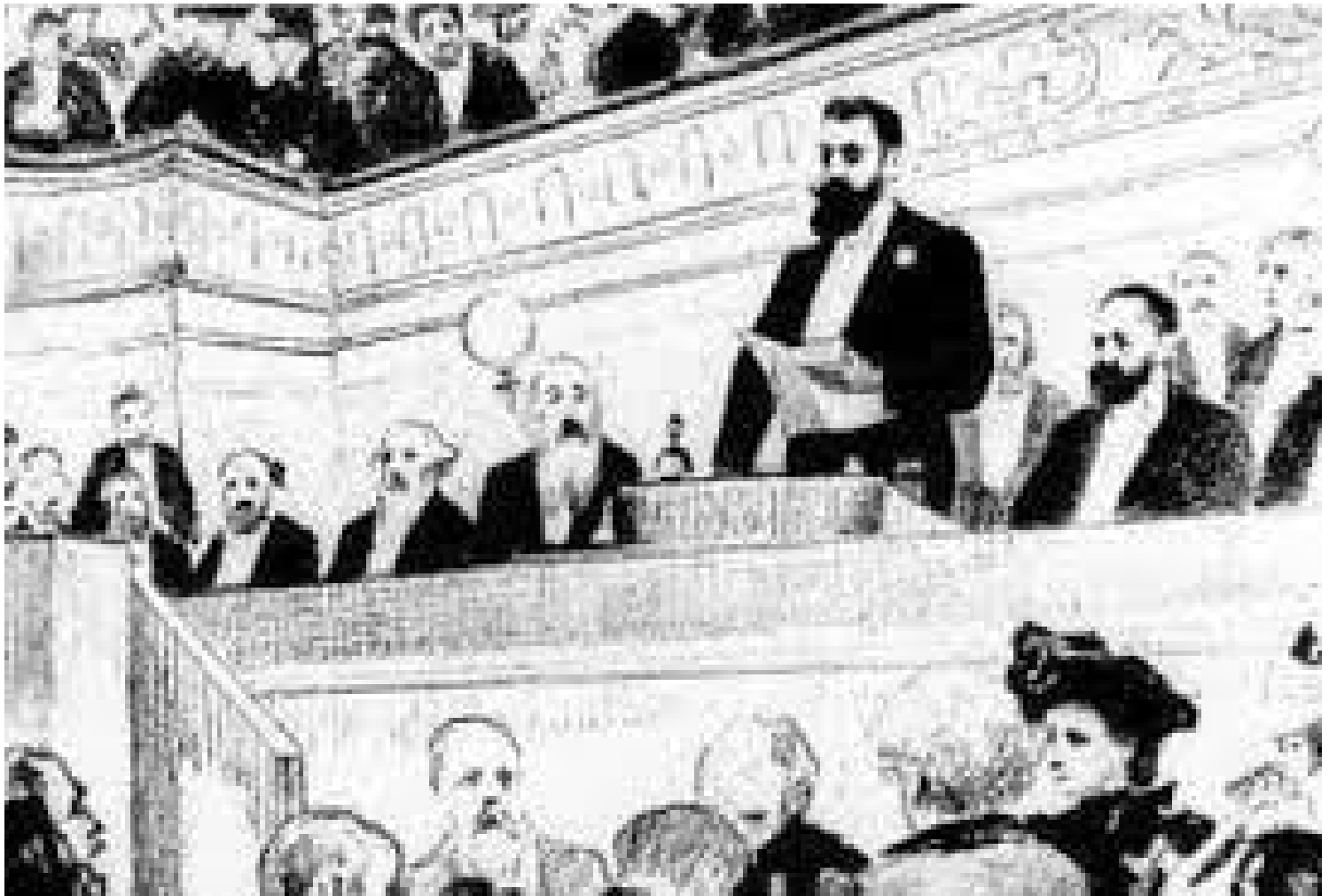
First Zionist Congress with Theodor Herzl

A youth conference for informal education and young leadership will also be held as part of the Congress. Among the participants will be nearly 1,000 young Israelis who will meet with Jewish youth leaders from the United States, Canada, Australia, Argentina, Brazil, Uruguay, the Netherlands, Mexico, Belgium, Ecuador, the United Kingdom, South Africa, Chile, Costa Rica, Paraguay, Peru, Italy, Spain, New Zealand, and Venezuela.