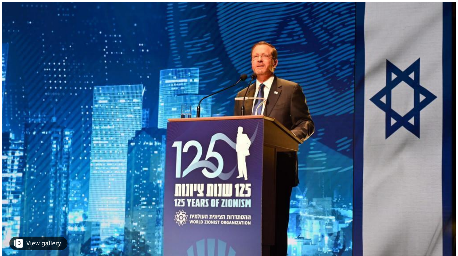
President Isaac Herzog at World Zionist Congress marking 125th anniversary in Basel

The World Zionist Congress is a gathering of Zionist Jewish representatives from forty countries around the world, and is the highest body in terms of legislation and policy-making of the World Zionist Organization, which acts similarly to a Jewish parliament. The delegates are elected representatives from the Zionist Federations all over the world, whose members are members of the World Zionist Organization.