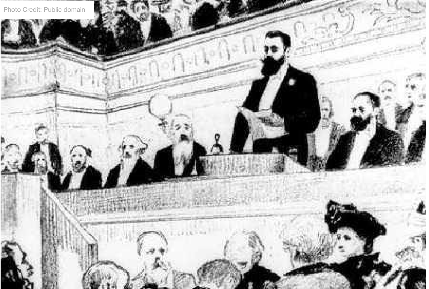
Theodor Herzl presiding over the first Zionist Congress in Basel, Switzerland, August 29–31, 1897.

The American Zionist Movement (AZM) has announced a record-breaking 22 slates will compete in the 39th World Zionist Congress election, reflecting a broad spectrum of political views, religious affiliations, and cultural traditions.